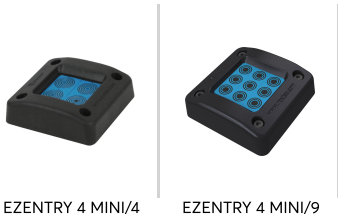
EZENTRY 4 MINI/4